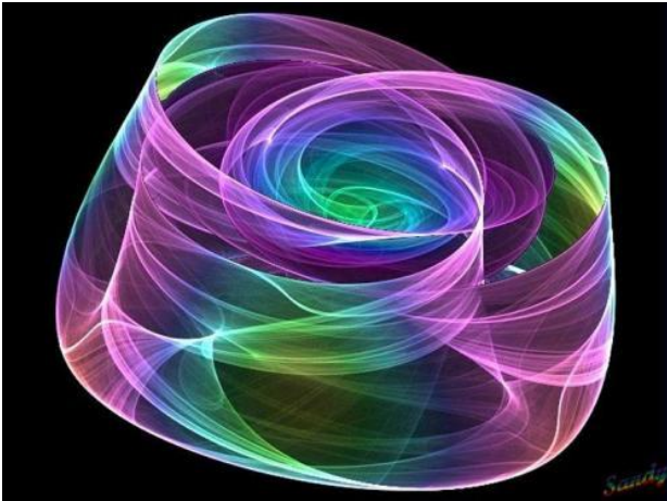
Fig. 2: Example of two figures simply placed in an invisible two-column table.

It is mandatory to present sample results in your abstract. Illustrate your approach and latest results by referring to figures as demonstrated here (Fig. 2 and Fig. 3). Clearly distinguish between already obtained results and those you might expect during the course of your work and eventually include in the final presentation material (PowerPoint Presentation which supports your oral presentation, or poster which supports your poster presentation).